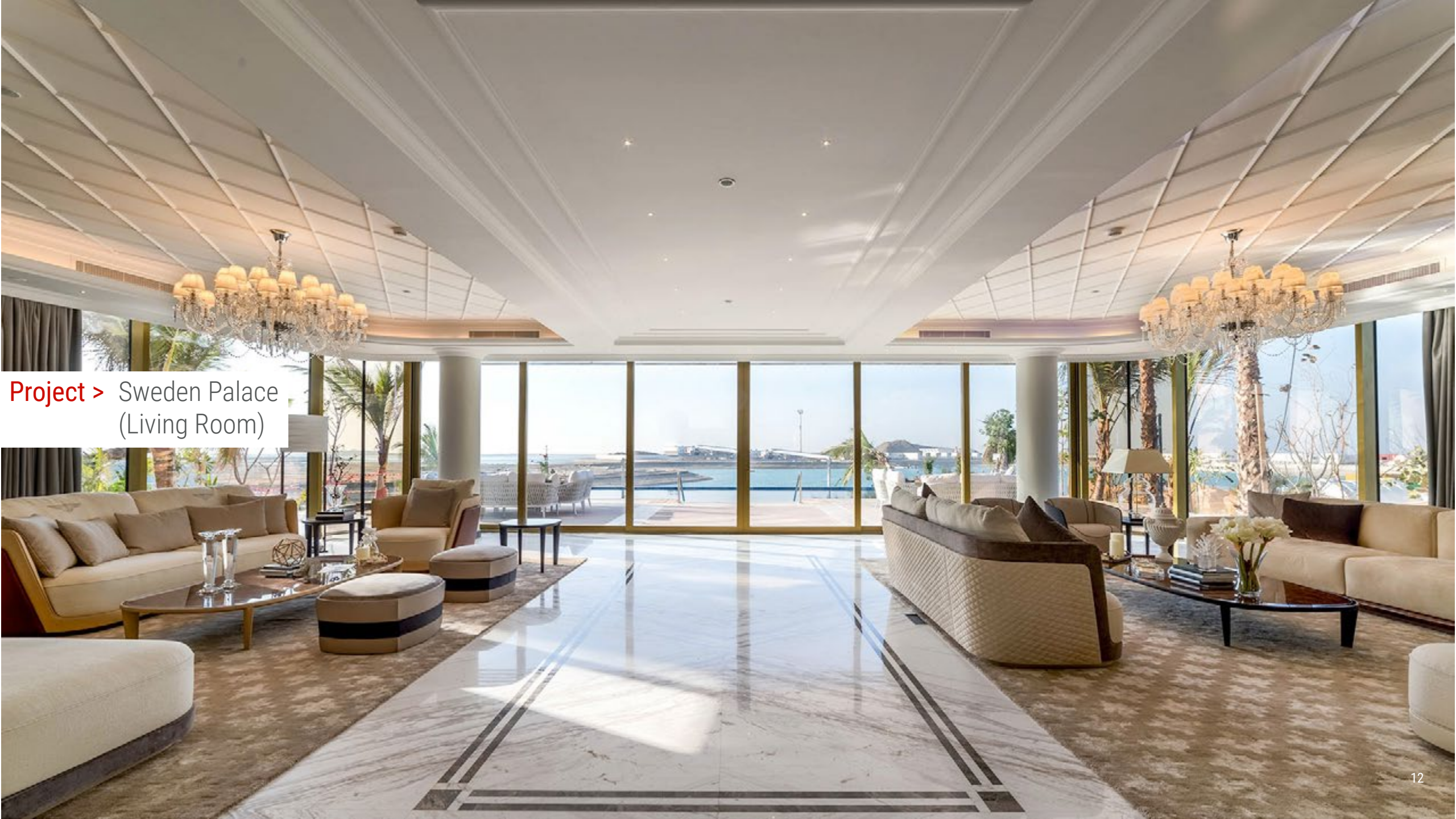
Project > Sweden Palace (Living Room)